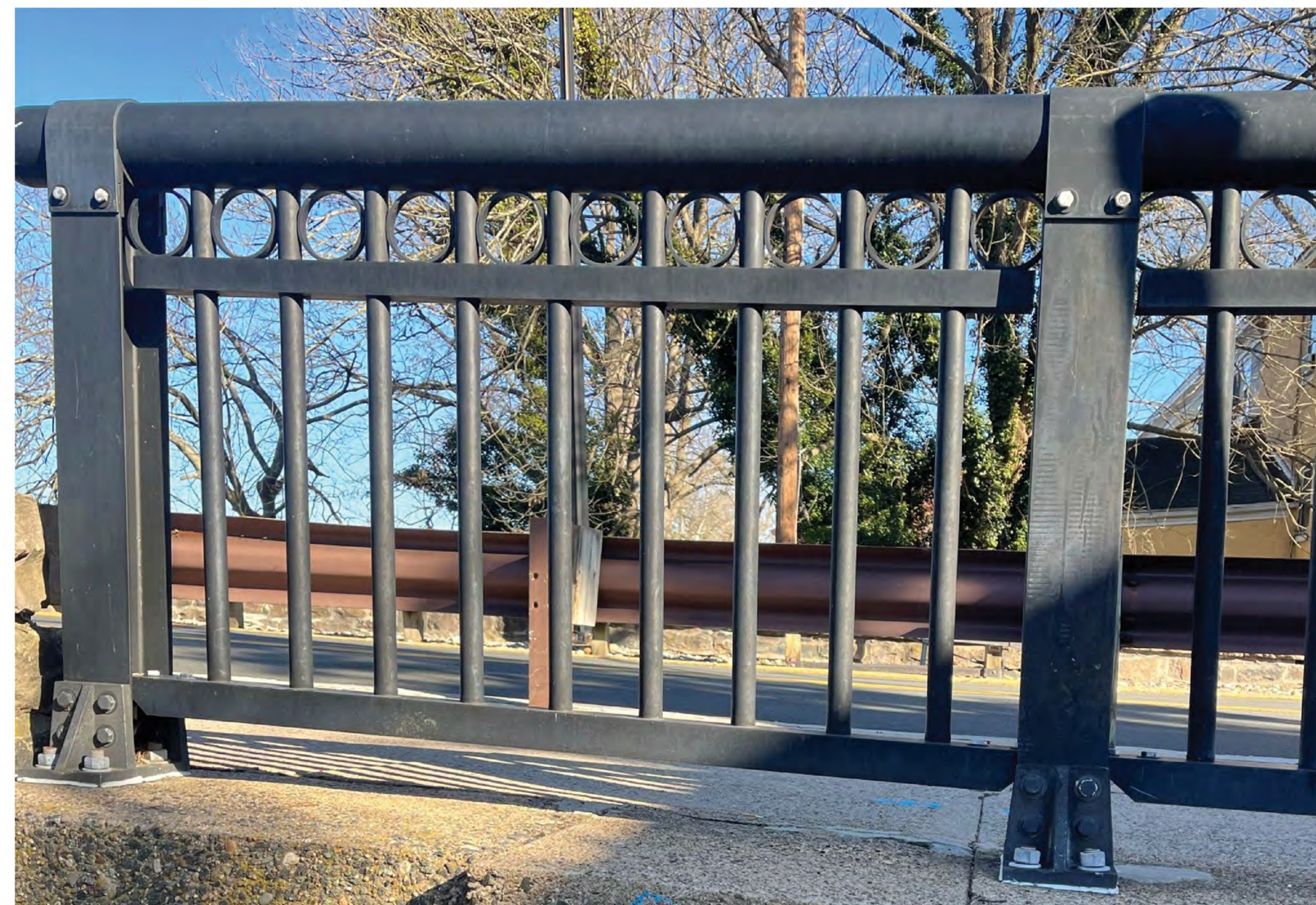
Existing Railing Condition