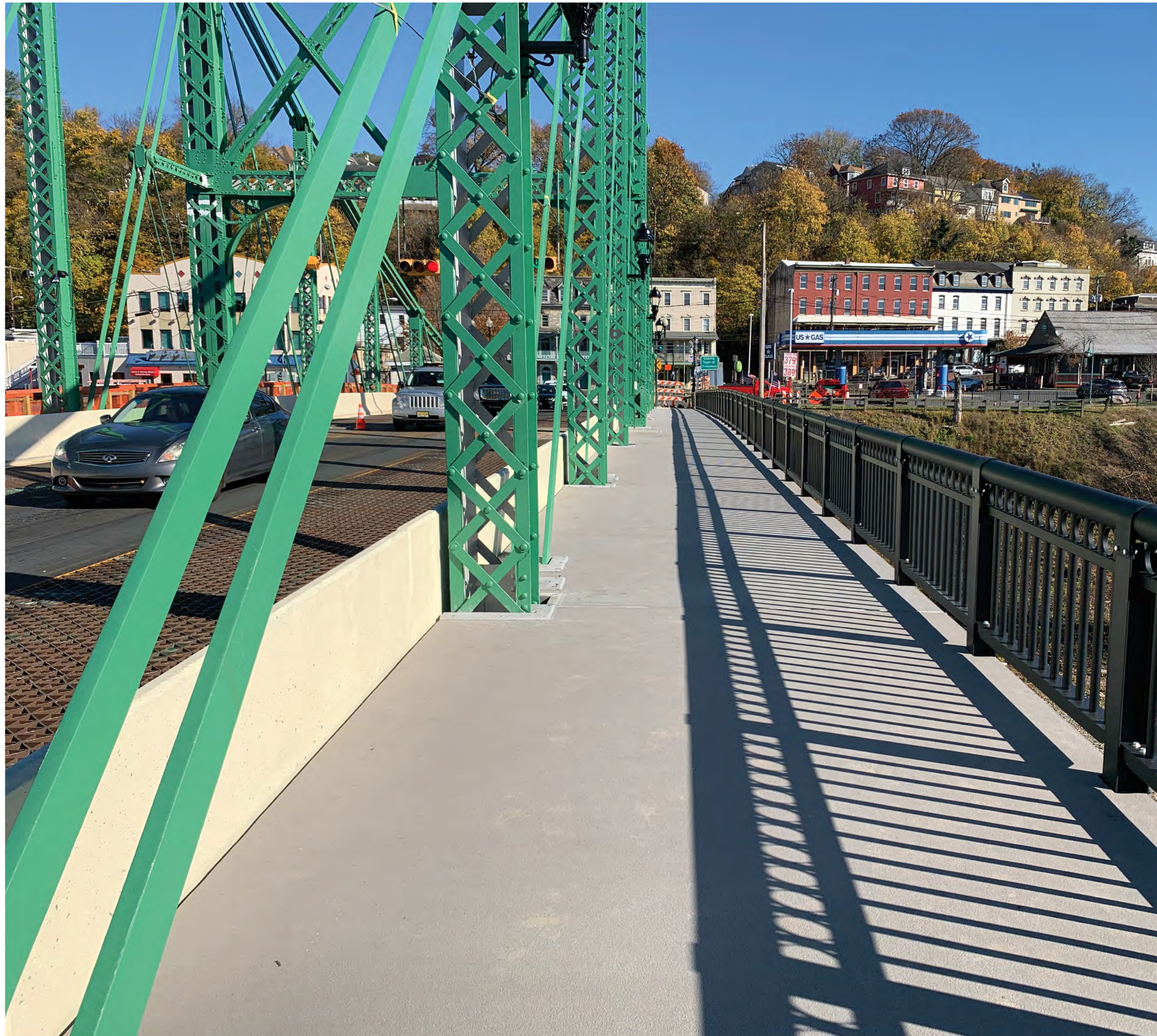
Northampton Street Completed Bridge Walkway