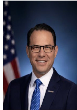
Governor of Pennsylvania Josh Shapiro