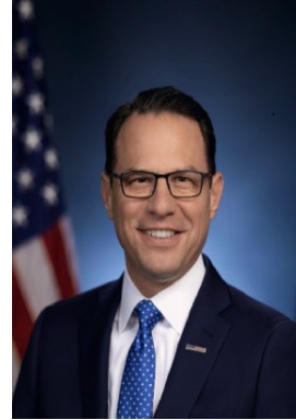
Governor of Pennsylvania Josh Shapiro