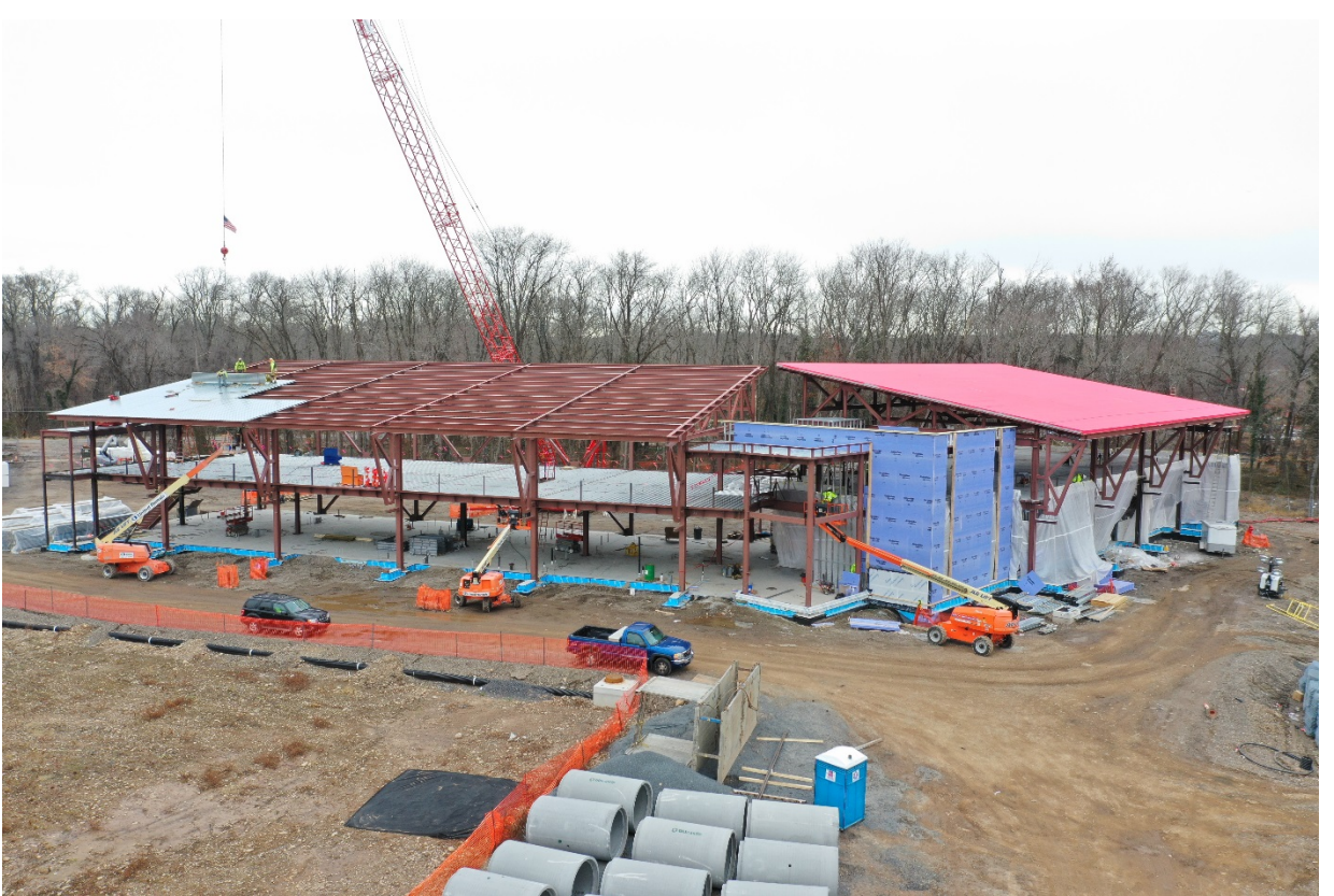
Steel Erection and Curtain Wall