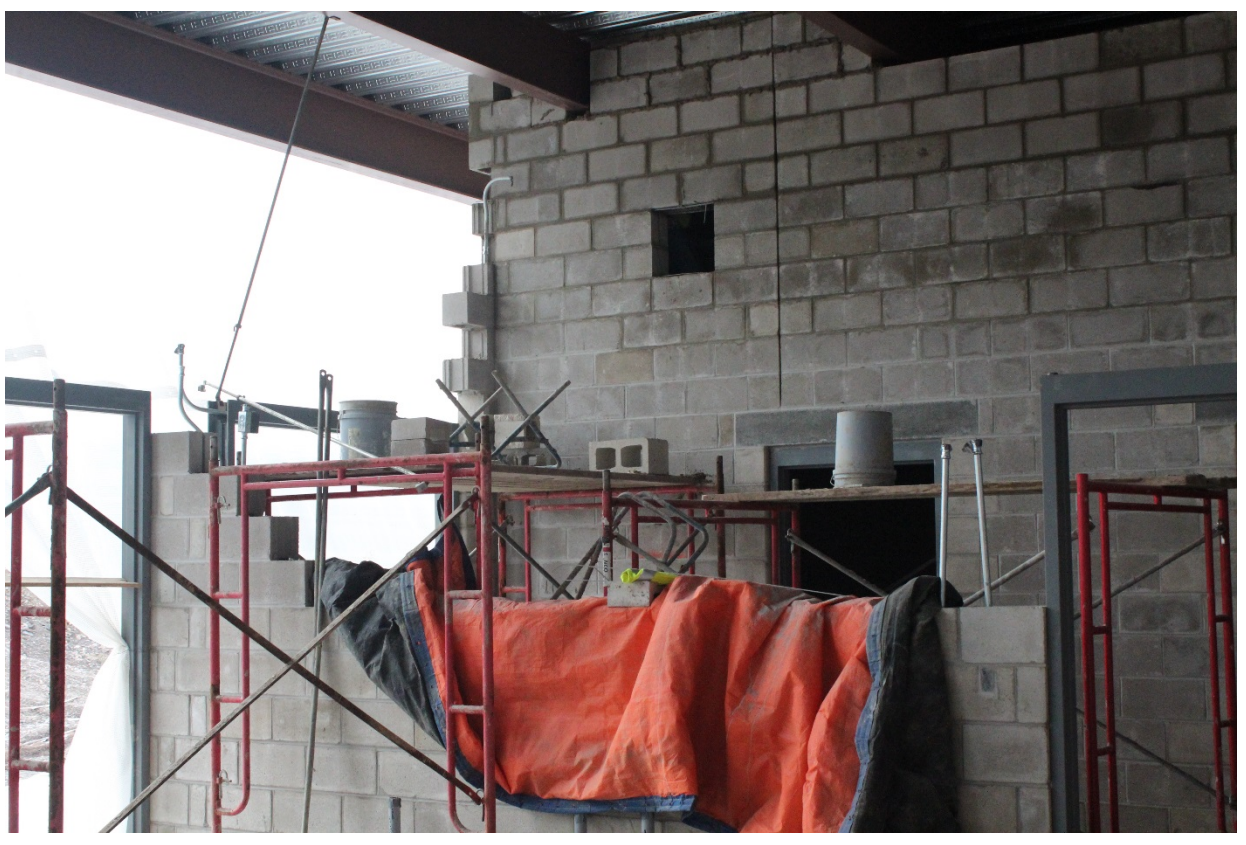
First Floor Block Walls