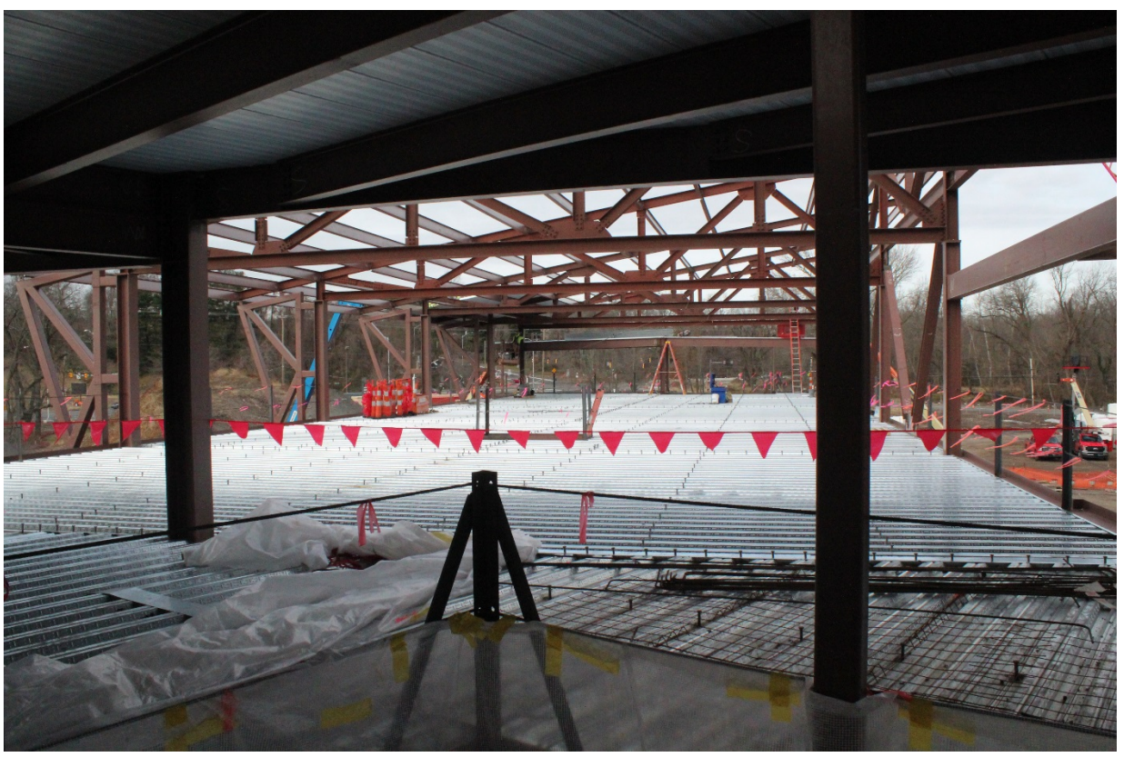
Steel Erection and Slab on Deck