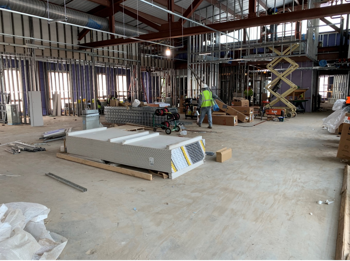
Second Floor Hall/Offices