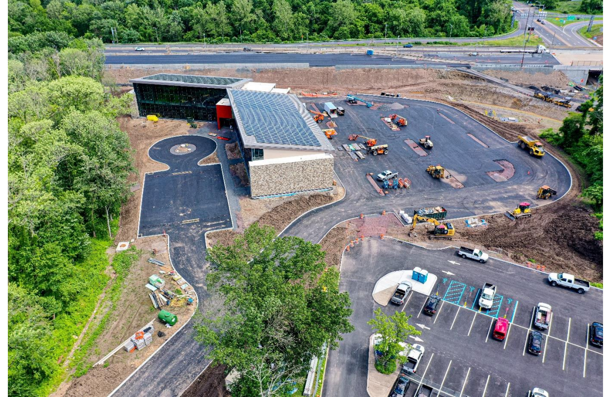
Aerial Image of Building & Site