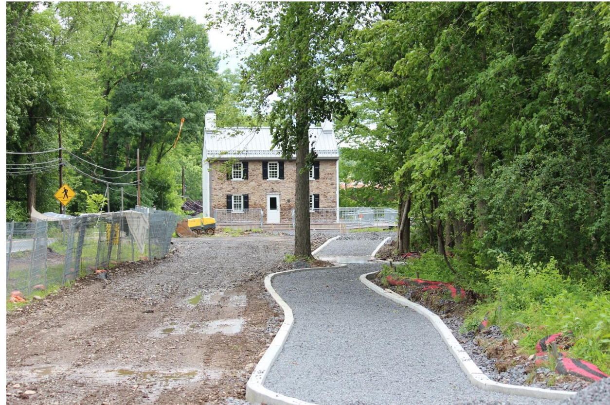
Front Elevation & Path