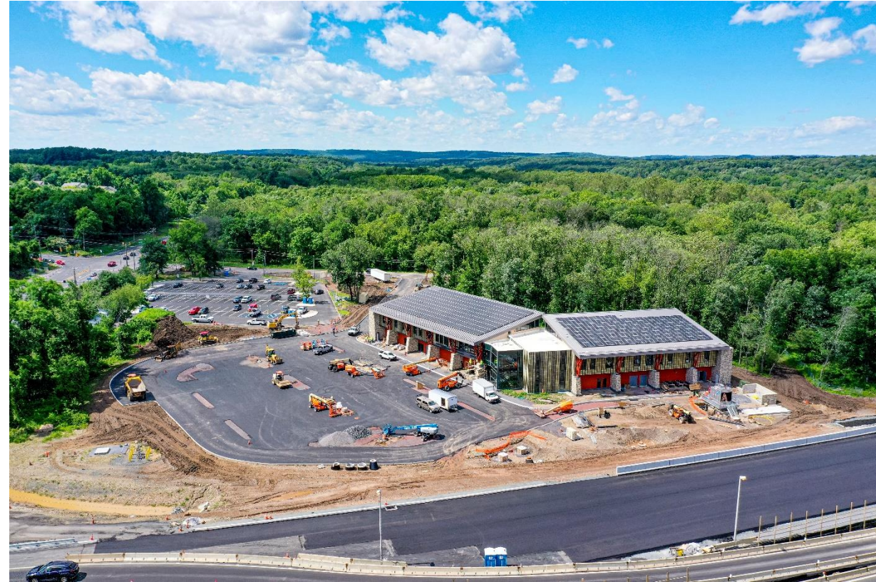
Aerial Image of Building & Site