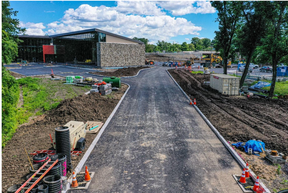
Aerial Image of Building & Site