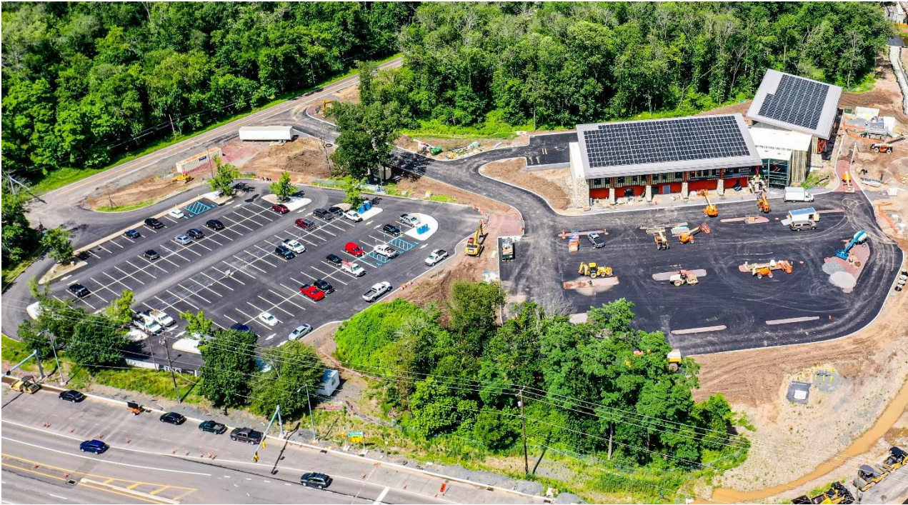
Aerial Image of Building & Site