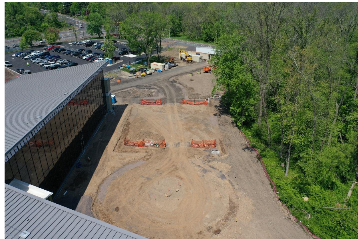
Aerial Image of Building