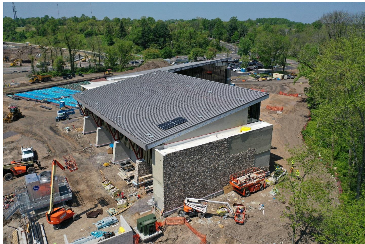
Aerial Image of Building