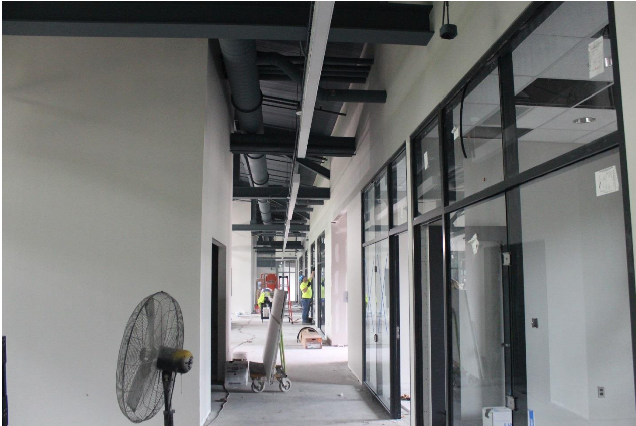
Purchasing Dept. / Finance Dept.