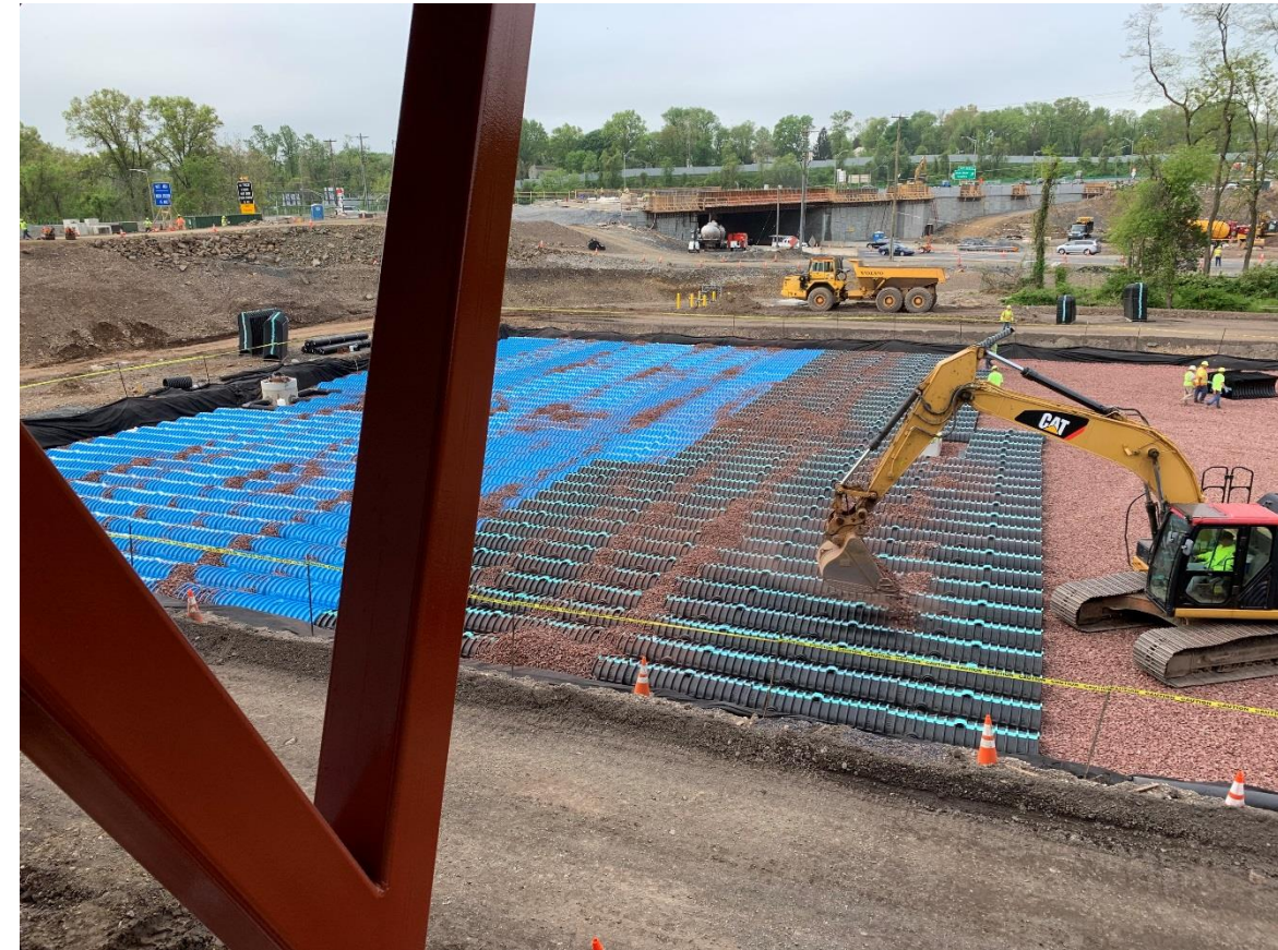
Underground Stormwater System