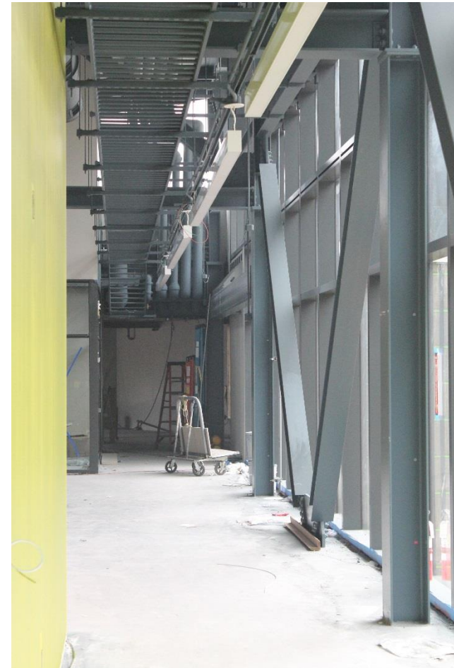
Second Floor Hallway