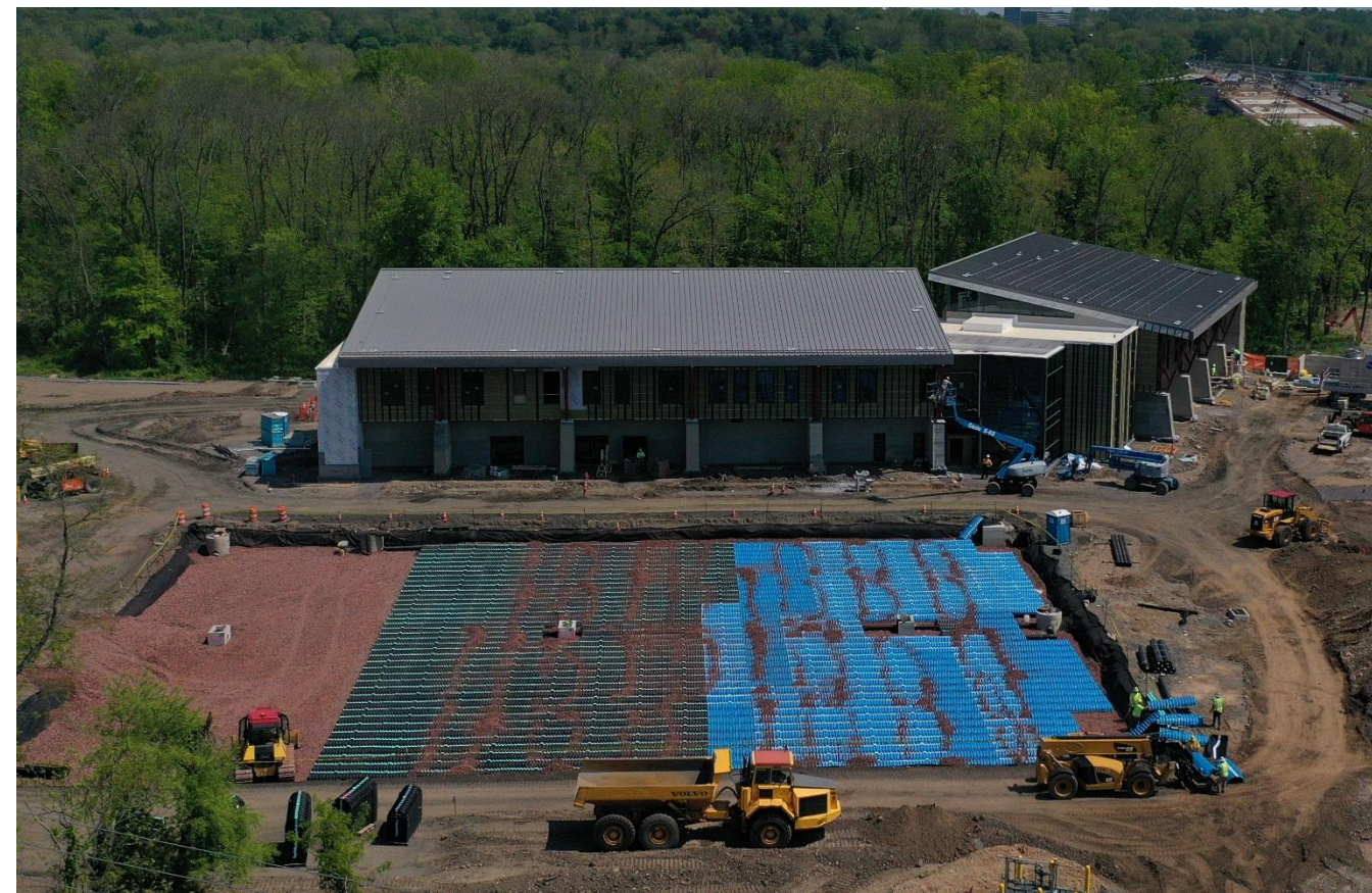
Underground Stormwater System