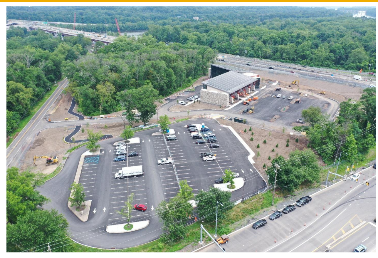
Aerial Image of Building & Site