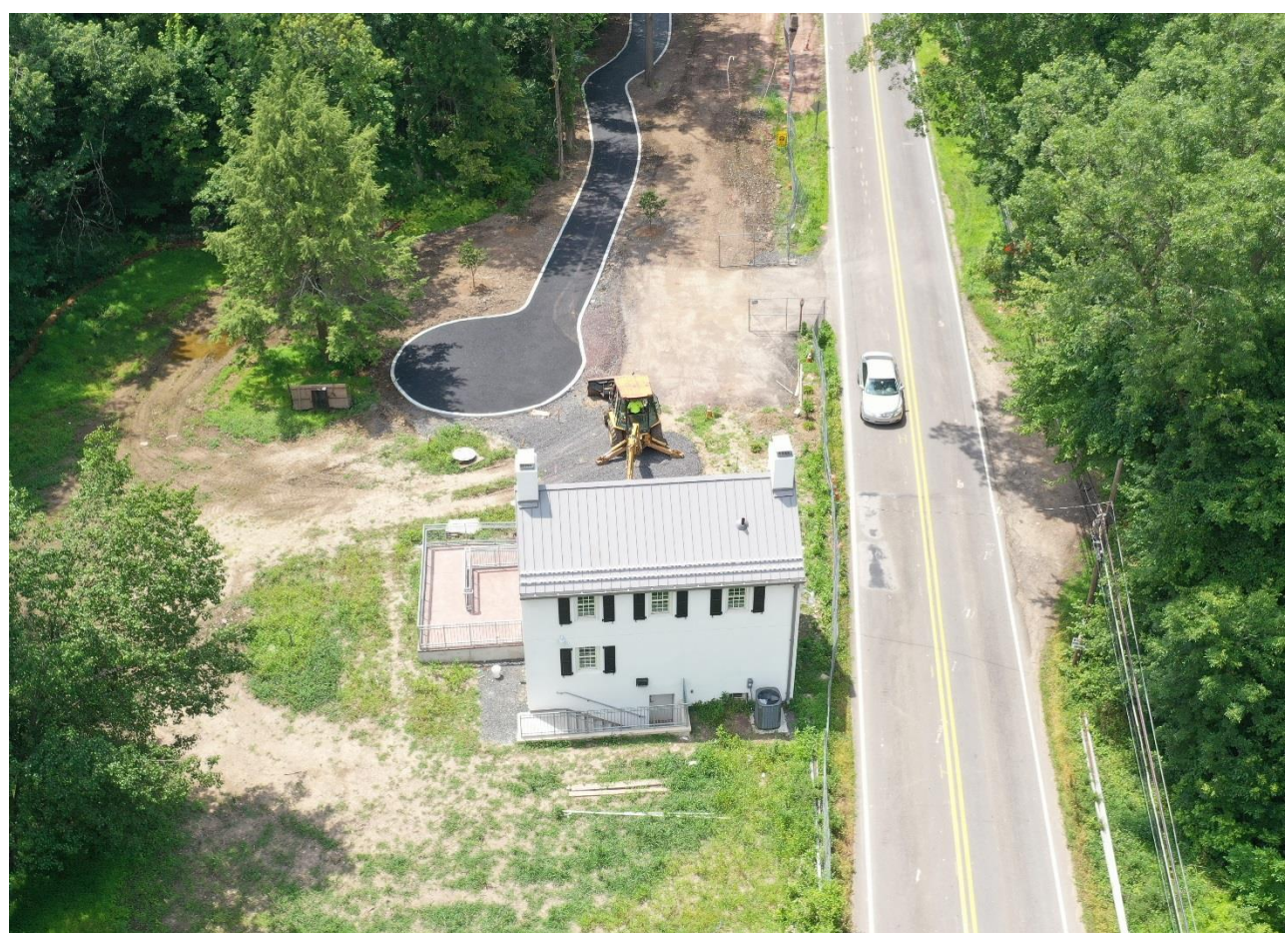
Front Elevation Aerial Rear Elevation