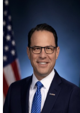
Governor of Pennsylvania Josh Shapiro