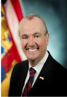
Governor of New Jersey Phil Murphy

A board of 10 commissioners - five from each state -- governs the Commission. The New Jersey members are nominated by their Governor and confirmed by the State Senate for a three-year term. The Pennsylvania members are appointed by their Governor and serve at his/her pleasure. A full-time Executive Director has administrative charge of all Commission services and activities.