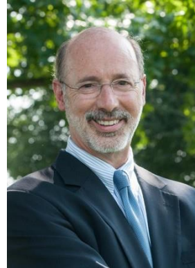
Governor of Pennsylvania Tom Wolf