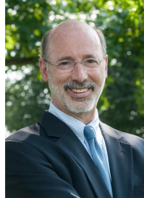
Governor of Pennsylvania Tom Wolf