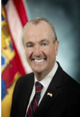
Governor of New Jersey Phil Murphy

A board of 10 commissioners - five from each state, governs the Commission. The New Jersey members are nominated by the Governor and confirmed by the State Senate for a three-year term while the Pennsylvania members are appointed by the Governor and serve at his pleasure. A full-time Executive Director has administrative charge of all activities of the Commission.