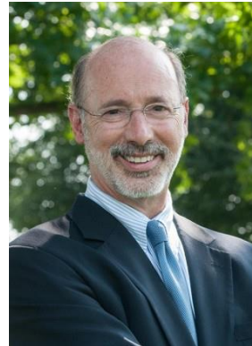
Governor of Pennsylvania Tom Wolf